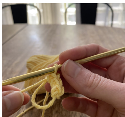
Single crochet 6