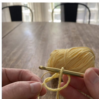
Pull up a loop.