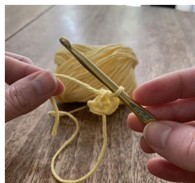
Magic loop made.