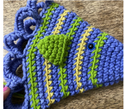
Side Fin Placement

Rnd 4: *SC in next 2 ST, 2 SC in next ST.** Repeat from * to ** around. (12)