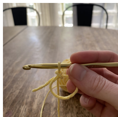
Yarn over and pull through.