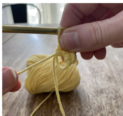
Pull end string to tighten snugly.