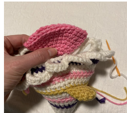
Stitch tail fin in same stitch as the back edge.