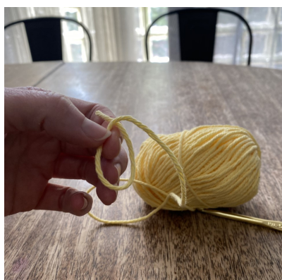
Loop yarn around finger with running yarn over the end.