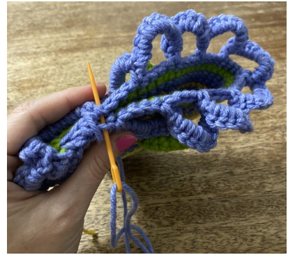
Stitch Back edge of body to Center.

Assembly: Fold the fish body in half along the color changes. Lay the fish body flat and mark the placement of the eyes. I put the eyes in round 8, matching the height of each eye on both sides of the fish. Now stitch the side fins in place using a yarn needle and the long tail of yarn. Stitch fins at equal height on each side of the fish. I put the fins in round 13. Now, using fiberfil, stuff the body of the fish firmly. Using a yarn needle, begin to sew the back seam of the fish. Join the back fin in the same seam as the back seam to stitch the back fin into place. Finally, cut a piece of each color of yarn 5 inches long and thread it through the bottom of the fish near the back seam for a trailing fin. Knot in place to secure.