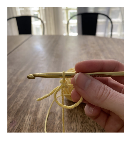
Yarn over and pull through.