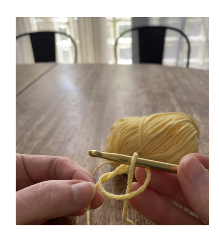
Wrap yarn around fingers,