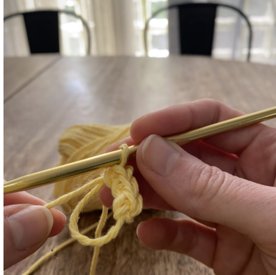
Continue SC around the ring.