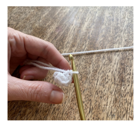
Keep stitches in a wedge shape.

Rnd 7: 3 HDC in first ST, * HDC in next 5 ST, 2 HDC in next ST,** repeat from * to ** 2 more times. HDC in next 2 ST. 3 HDC in last St. CH 1, turn.