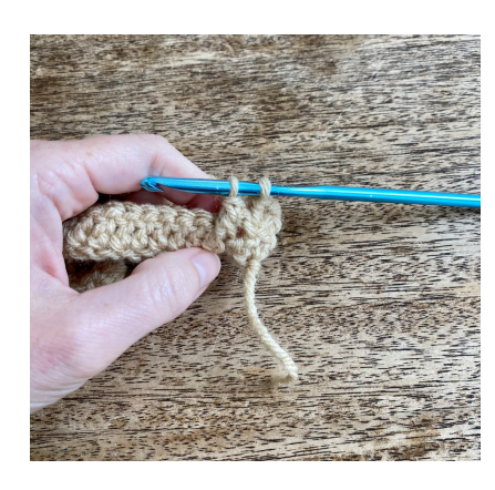
Now we have two loops on the hook.