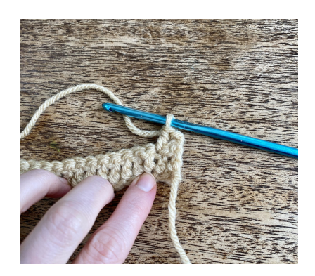
Identify Front Post