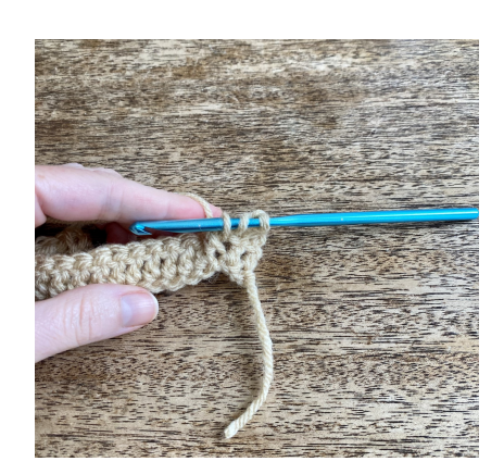
Yarn over and pull through two loops on the hook.