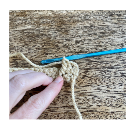
Yarn over and pull through last two loops on hook. FPDC made.