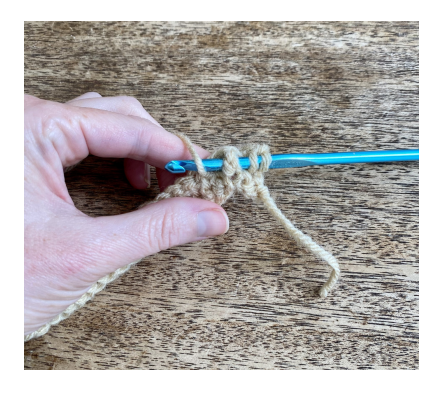
Yarn over and pull through the post.