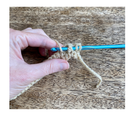
Yarn over and insert hook behind the post.