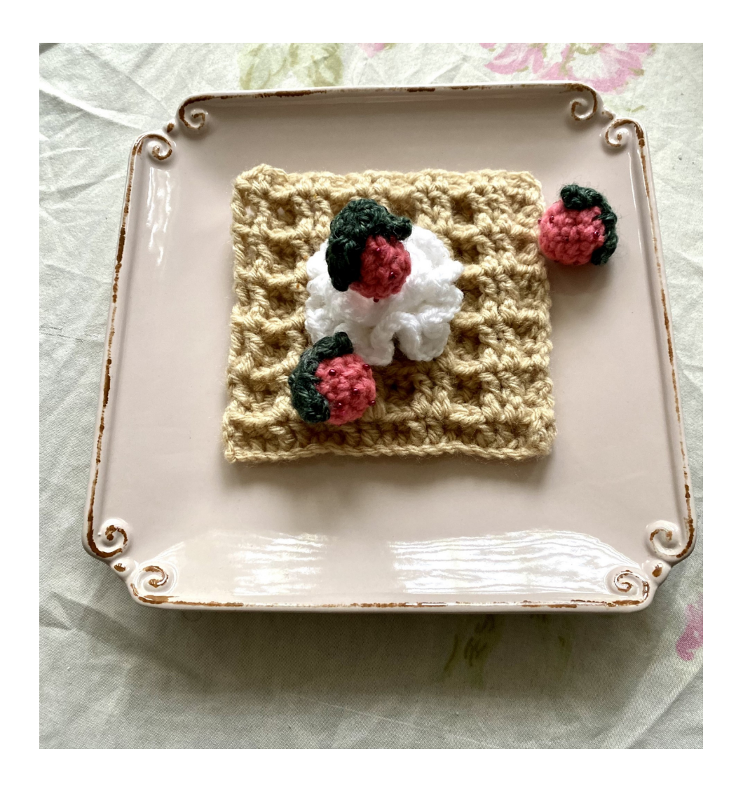
A Crochet Pattern by: Abby Holmgren Briarberryfarmhouse.com