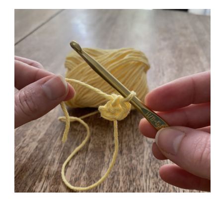
Pull loose end snugly to close the loop.