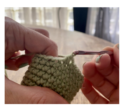
Pull through all three loops on the hook. One Decrease Stitch made.