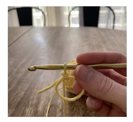
Now, Single crochet around the loop.