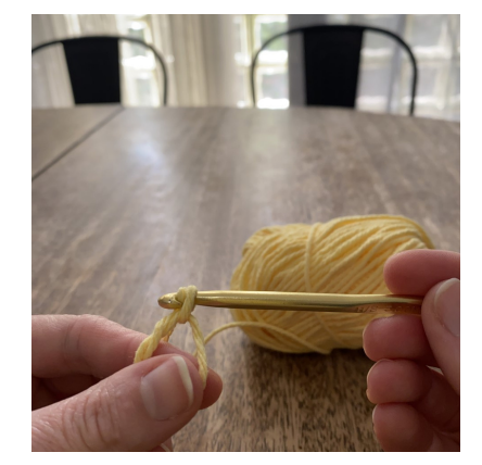
Yarn over and pull through the loop on the hook.