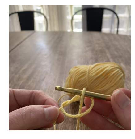
Insert hook into the loop and pull up a loop.