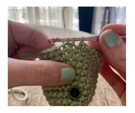
Yarn over one more time.