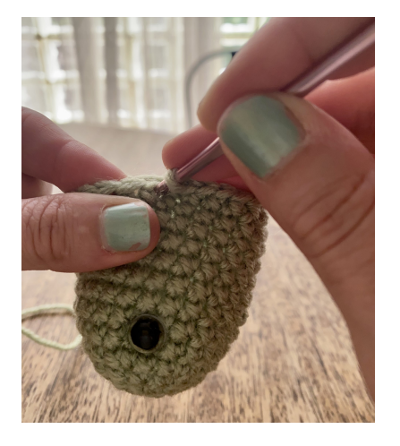
Insert hook into the next stitch.