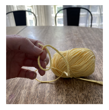
Make a loop