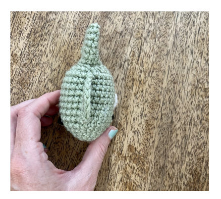
Stitch the top fin centered between the eyes on the fishes back.