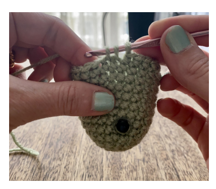
Yarn over and pull up a loop. Now you should have 3 loops on the hook.