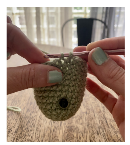
Pull up a loop.