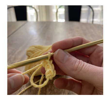
Make 6 Single crochets around the loop.