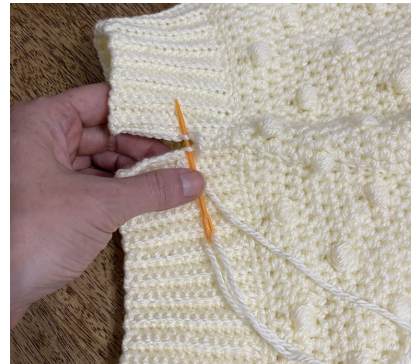
Attach yarn to top left panel.

Repeat rows 2-3 around full circle of bloomer body. Fasten off leaving a long tail to stitch the edges of the waistband together. Using a yarn needle, stitch edges together. See picture.