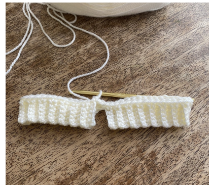
Join to start of round .