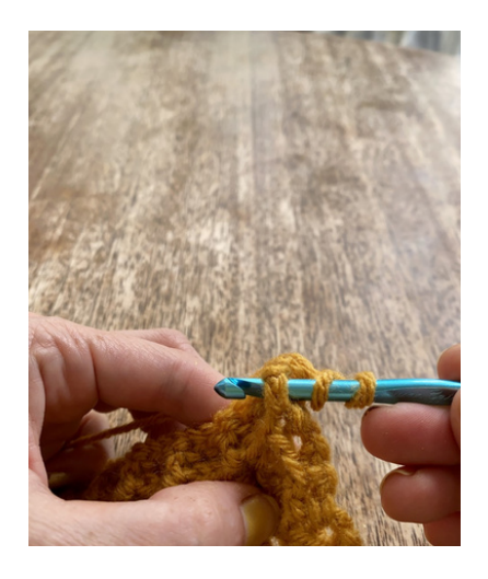
Insert hook through the front post of next stitch.