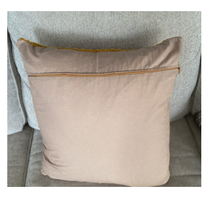
Back of pillow with Zipper

Open seam ends and press flat to prepare for zipper placement. See Photo below.