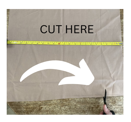
Cut here, Fold Over, and Baste across seam edges.