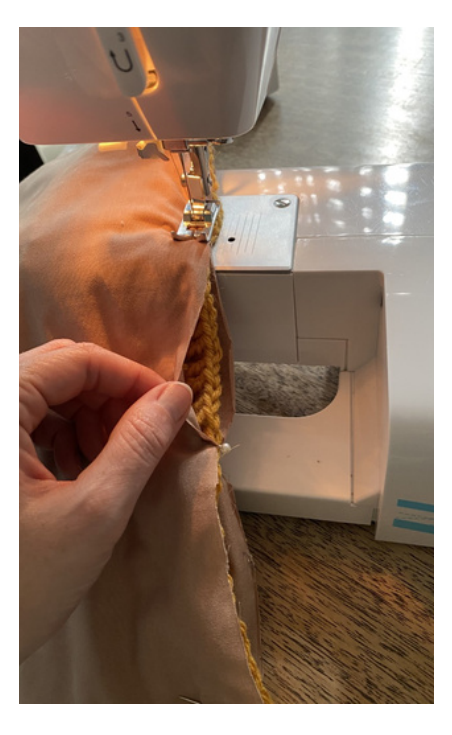
Be sure waffle panel is being stitched between fabric panels. May have to stretch gently to fit.