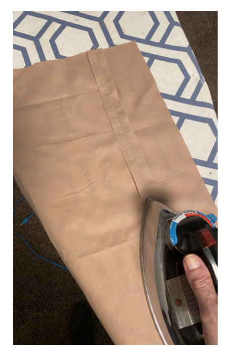
Press basted seam open.