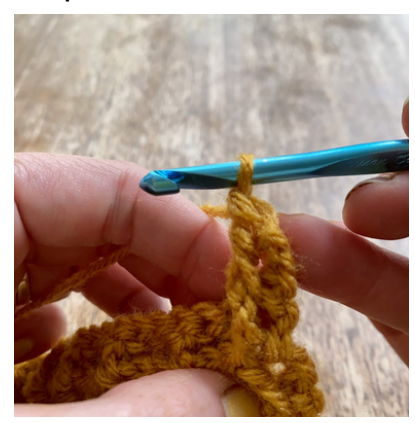
Front Post Double Crochet complete.