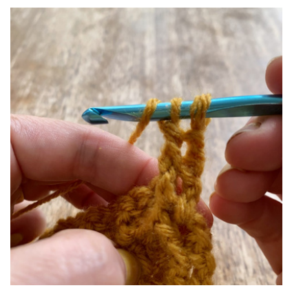
Yarn over and pull through remaining two loops on hook.