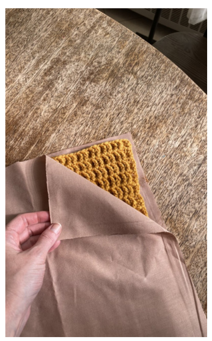
Sandwich waffle panel with waffle side facing the zipper.