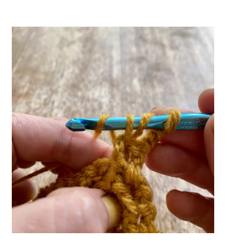
Yarn over and Pull through two loops on the hook.