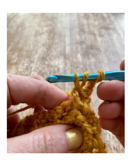
Yarn over and pull up a loop.